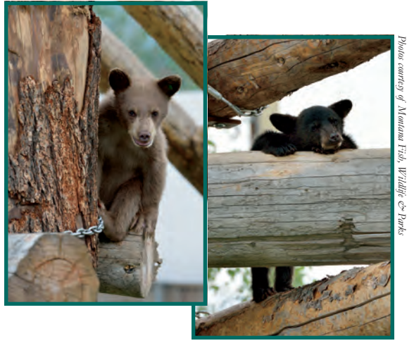
Orphaned Black Bear cubs enjoy daily exercise, building muscle and climbing skills in the wildlife center's outdoor enclosures. When cubs reach a healthy weight, they are released back to their original habitat in the wild.

Fortunately for visitors, cubs can be seen when they are in their outdoor enclosures via closed-